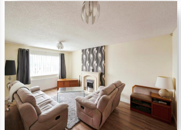
Oakbank Close, Swinton Mexborough S64 8LL