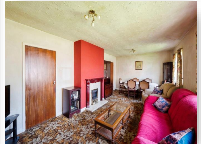
St. Helens Close, Thurnscoe Rotherham S63 0RD