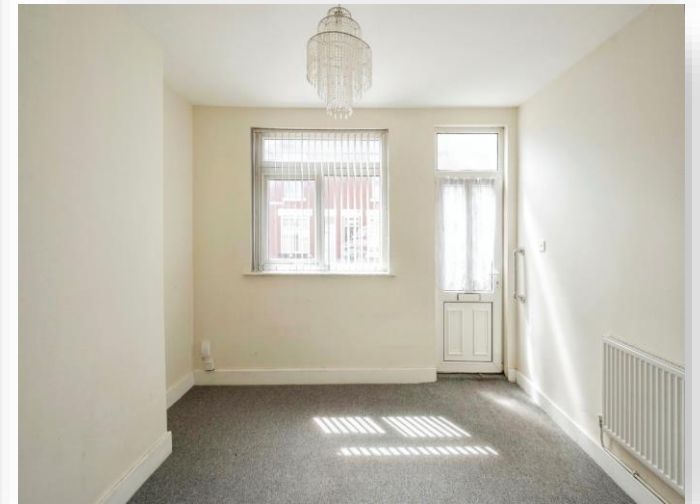
Oliver Street, Mexborough S64 9NW