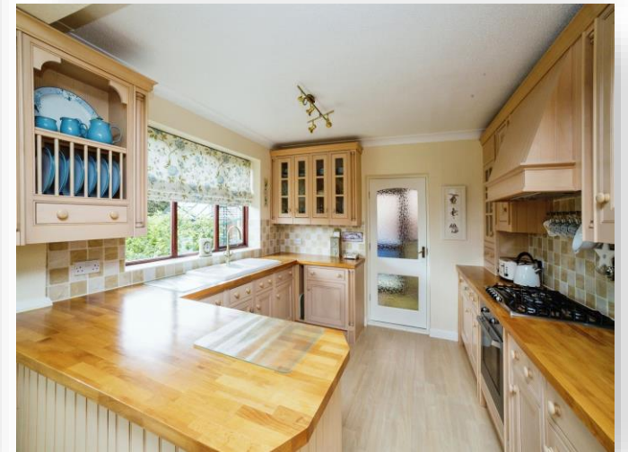
Church Lane, Harlington Doncaster DN5 7HZ