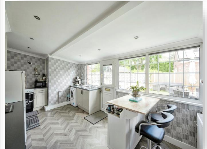
Troutbeck Close, Thurnscoe ROTHERHAM S63 0TW