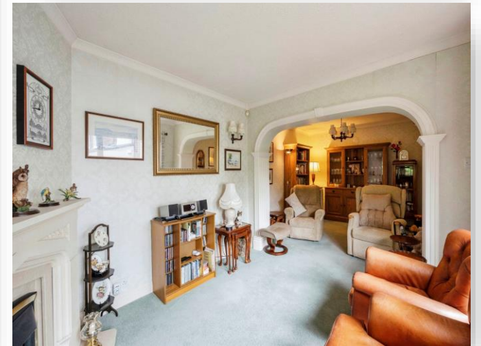
Park Close, Swinton Mexborough S64 8JG