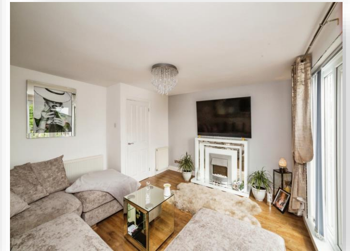
Highthorn Road, Kilnhurst Mexborough S64 5UP