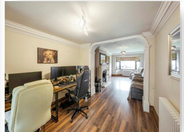
Peartree Avenue, Thurnscoe Rotherham S63 0NR