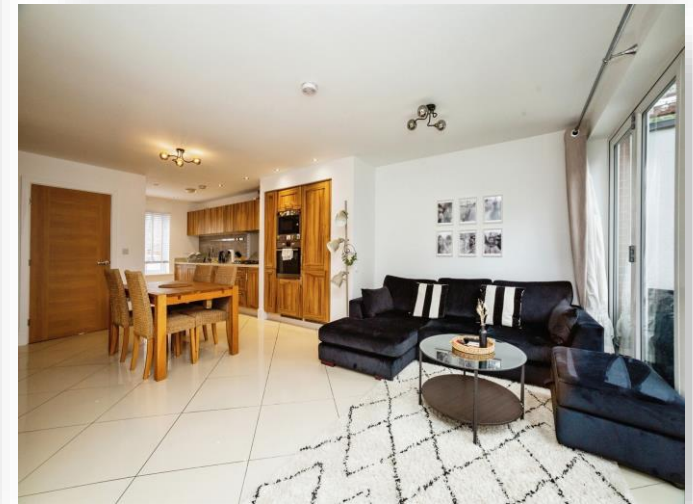
Wild Geese Way, Mexborough S64 0FB