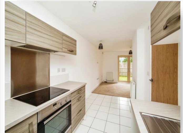
Comelybank Drive, Mexborough S64 0FD