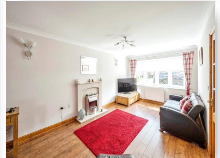
Woodside View, Bolton-Upon-Dearne Rotherham S63 8GZ