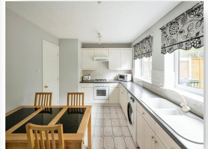
Templestowe Gate, Conisbrough DONCASTER DN12 2HR