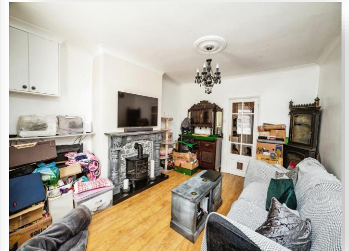
Main Street, Goldthorpe Rotherham S63 9JW