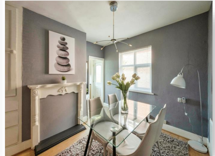
Park Road, Mexborough S64 9PE