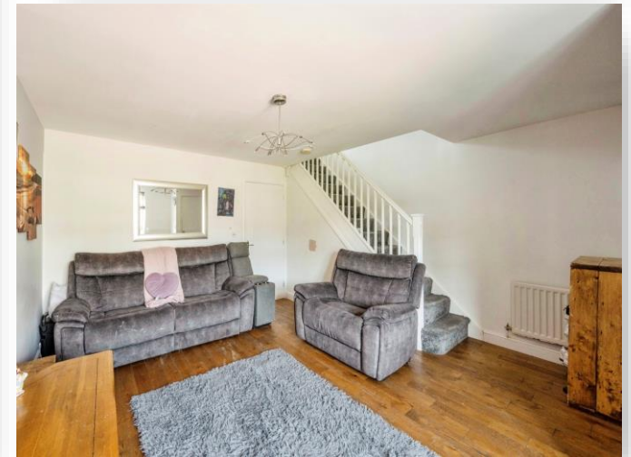
Collier Court, Brampton Bierlow Rotherham S63 6FB