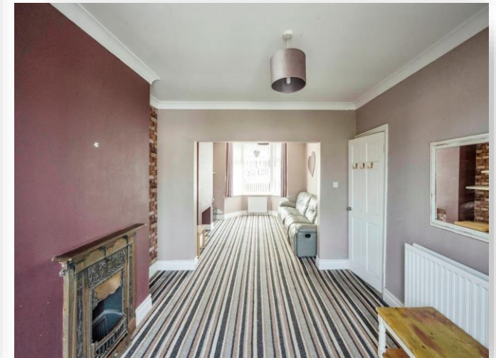
Grenfell Avenue, Mexborough S64 0AT