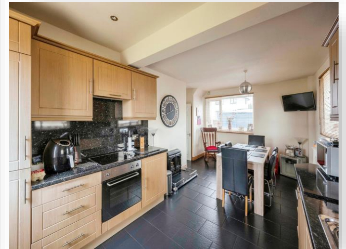
Maori Avenue, Bolton-upon-Dearne ROTHERHAM S63 8DU