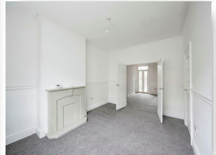
Sandymount Road, Wath-upon-Deerne Rotherham S63 7AD