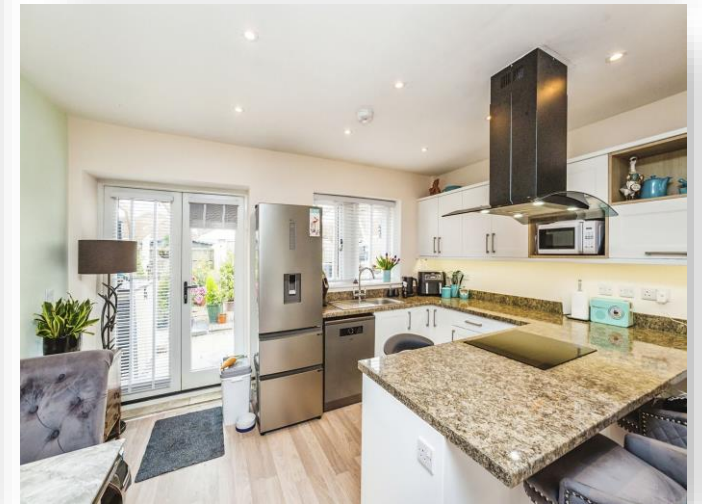
Shepherd Lane, Thurnscoe Rotherham S63 0JS