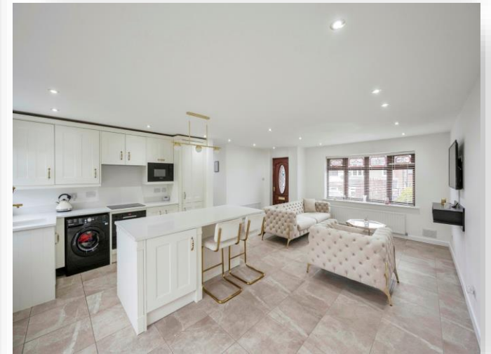
Drake Head Lane, Conisbrough Doncaster DN12 2AB