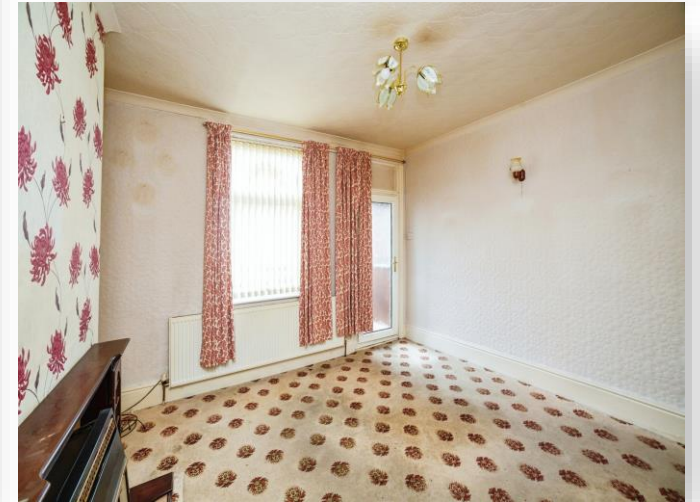
Furlong Road, Goldthorpe Rotherham S63 9PY