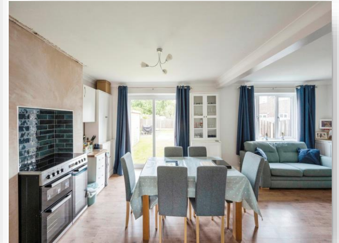
Wynmoor Crescent, Brampton Barnsley S73 0UD