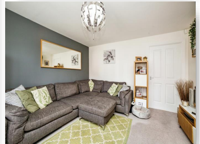
Dove Road, Mexborough S64 0NQ