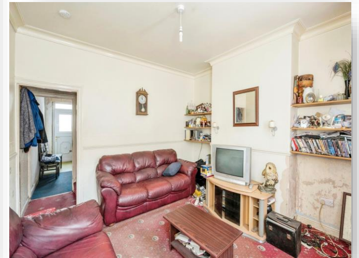
Wellington Street, Mexborough S64 9DD