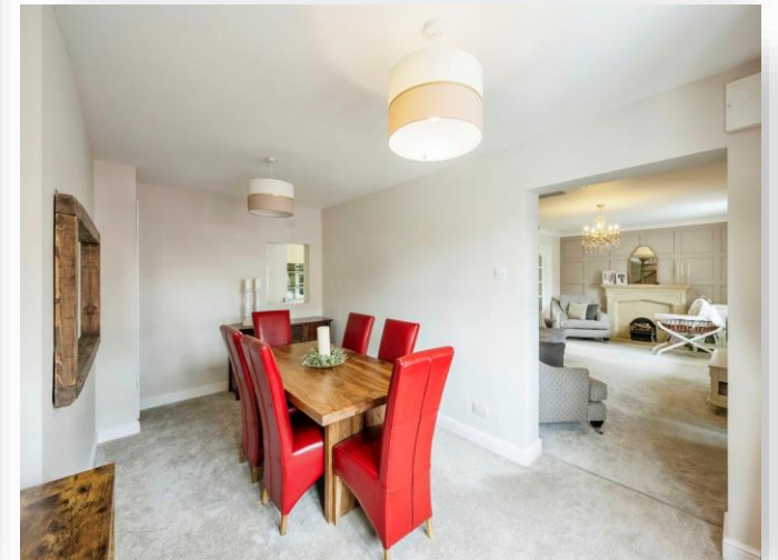
Old Road, Conisbrough Doncaster DN12 3LT