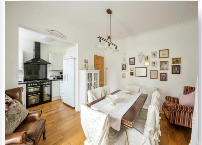
Auckland Road, Mexborough S64 0AN