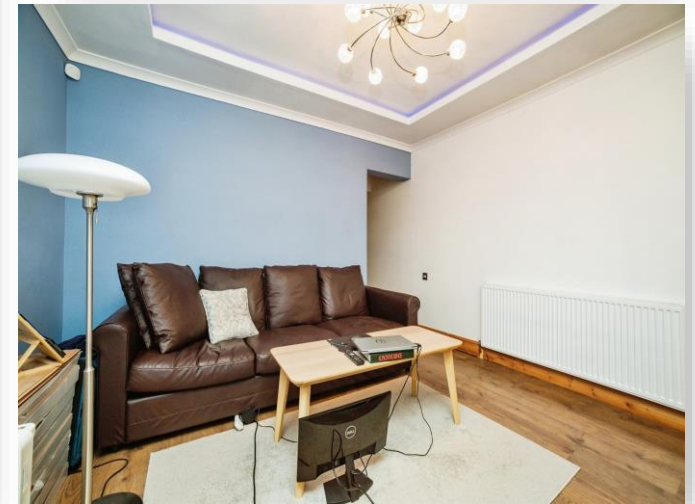
Railway View, Goldthorpe ROTHERHAM S63 9LN