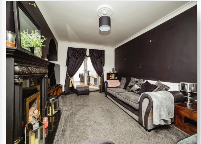
Park Road, Conisbrough Doncaster DN12 2EQ