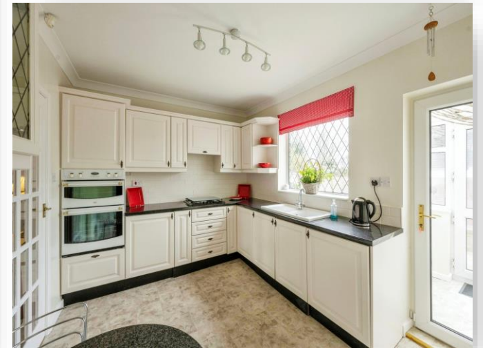
Elm Way, Wath-Upon-Dearne Rotherham S63 7PF