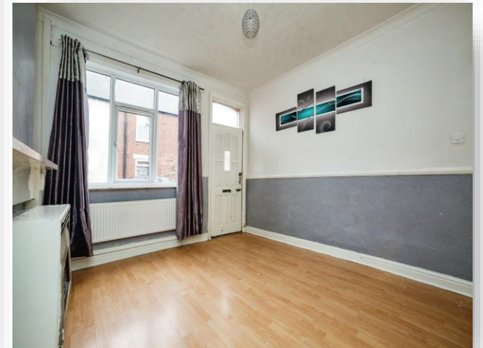
Gosling Gate Road, Goldthorpe Rotherham S63 9LU