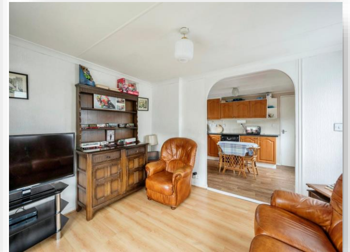
Park Homes, MEXBOROUGH S64 0HA