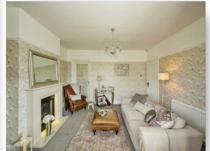
Chapel Street, Wath-Upon-Dearne Rotherham S63 7RL