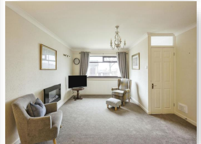
Ashdene Court, Swinton Mexborough S64 8RA