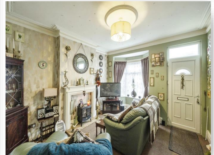
Shepherd Lane, Thurnscoe Rotherham S63 0JS