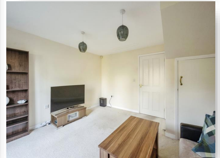
Park Crescent, Bolton-Upon-Deerne Rotherham S63 8NU