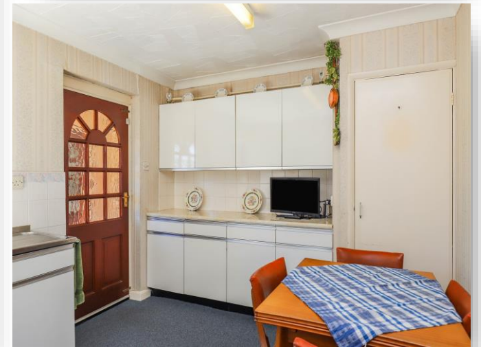
95 Deerfield Road, March PE15 9AD