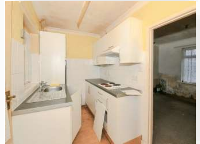
Lime Grove, March PE15 8JG