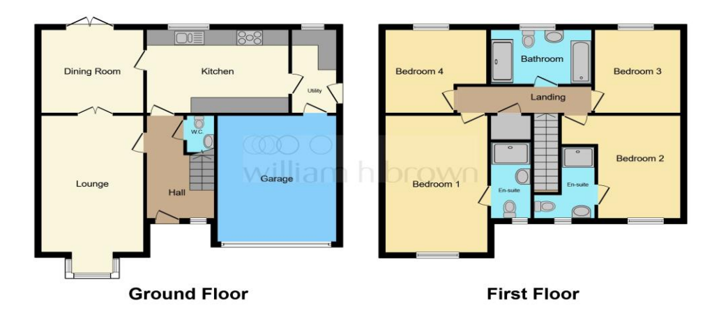
This floor plan is for illustrative purposes only. It is not drawn to scale. Any measurements, floor areas (including any total floor area), openings and orientation are approximate. No details are guaranteed, they cannot be relied upon for any purpose and they do not form part of any agreement. No liability is taken for any error, omission or misstatement. A party must rely upon its own inspection(s). Powered by www.focalagent.com