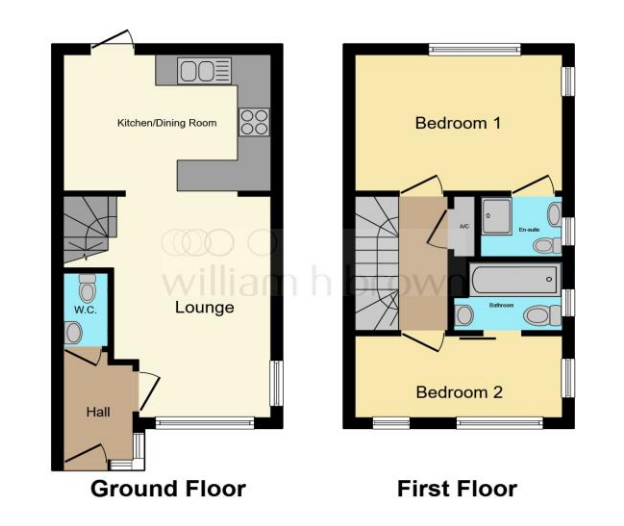
This floor plan is for illustrative purposes only. It is not drawn to scale. Any measurements, floor areas (including any total floor area), openings and orientation are approximate. No details are guaranteed, they cannot be relied upon for any purpose and they do not form part of any agreement. No liability is taken for any error, omission or misstatement. A party must rely upon its own inspection(s). Powered by www.focalagent.com