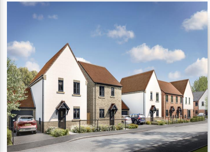
Plot 4 The Osiers, Edwards Way, Manera PE15 0HY