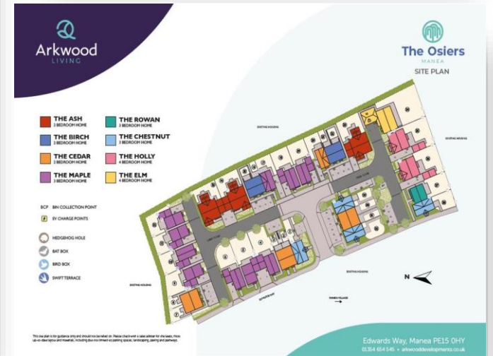
Plot 3 The Osiers, Edwards Way, Manea PE15 0HY