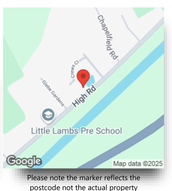
view this property online williamhbrown.co.uk/Property/MCH113528