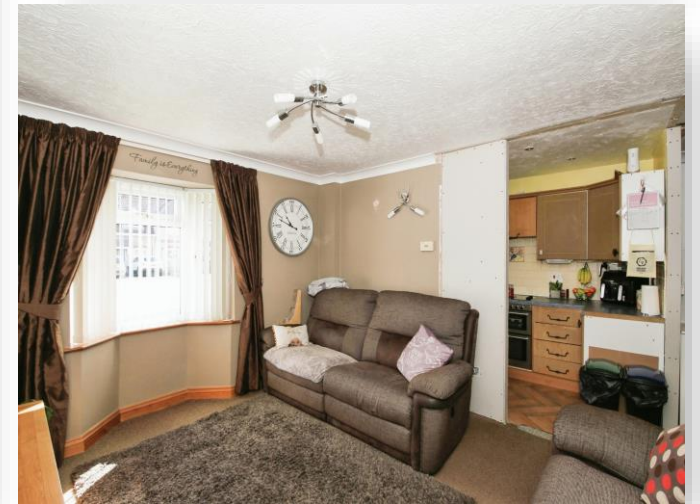
Ingoldsby Close, March PE15 9NL