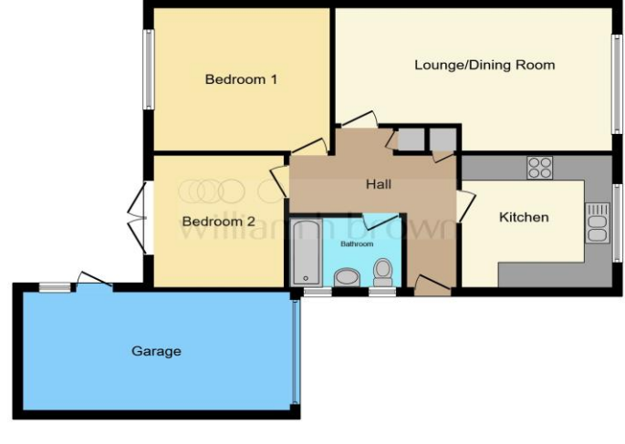
This floor plan is for illustrative purposes only. It is not drawn to scale. Any measurements, floor areas (including any total floor area), openings and orientation are approximate. No details are guaranteed, they cannot be relied upon for any purpose and they do not form part of any agreement. No liability is taken for any error, omission or misstatement. A party