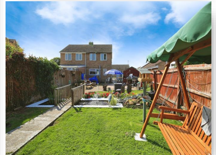
Bevills Close, Doddington PE15 0TT