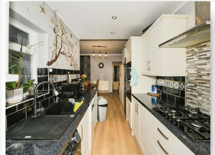
Creek Road, March PE15 8RD