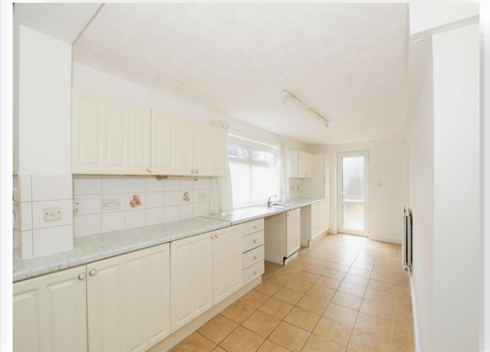
Elliott Road, March PE15 8BL