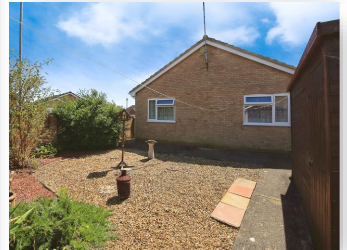
Creek Road, March PE15 8RN