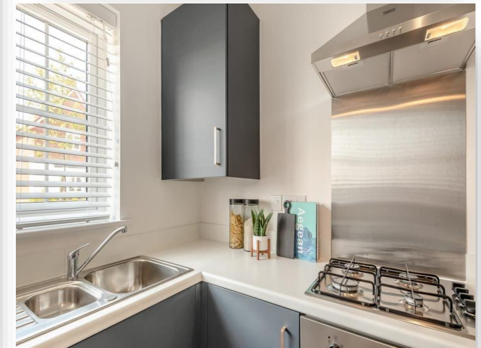
Plot 45, Primrose Grove March Road, Wimblington PE15 0RN