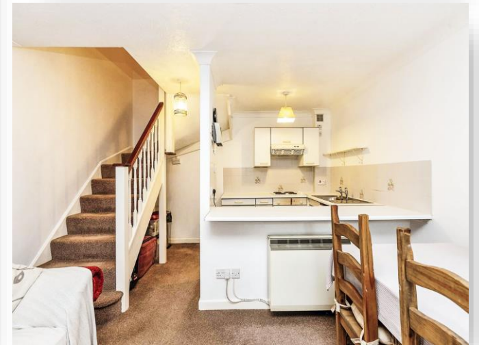
High School Close, March PE15 8NX